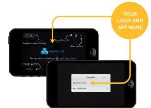
Wowza GoCoder Private Label Example

Wowza GoCoder Private Label allows you to white-label the Wowza GoCoder app , giving it your own branding and configuration settings. You can then deploy this custom-branded version directly to the Apple App Store or the Google Play Store for your users to download and use on their own smartphones and tablets. Contact Wowza for more details on this program. The Wowza GoCoder app is free to use, and the Wowza GoCoder Private Label offering is priced separately.